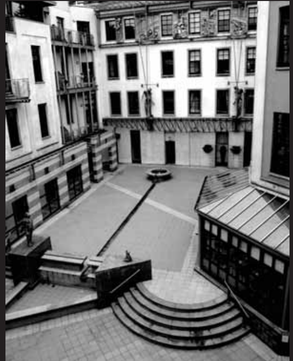
I t a l i a n C e n t r e A p a r t m e n t s

web: www.italiancentreapartments.com www.servicedapartmentcompany.com